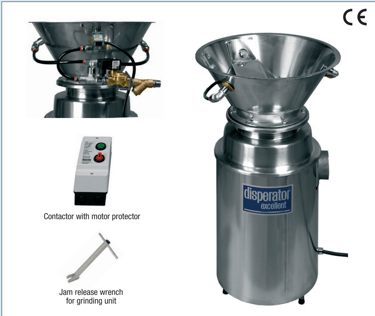
Contactor with motor protector